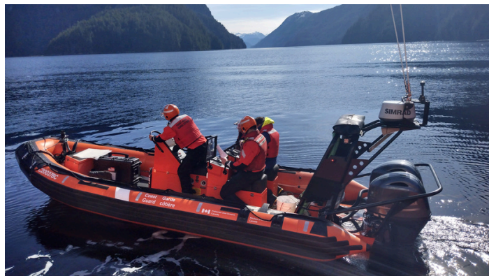
Researchers conducting fieldwork by boat in a central coast inlet.

This project will investigate whether the rate and/or type of primary productivity has changed in BC coastal waters (e.g. a decrease in total phytoplankton or a change from a short, diatom-based food chain to a longer food chain based on smaller phytoplankton), as a consequence of climate change. Such a change is thought to have occurred in Puget Sound, with negative effects on the early marine survival of juvenile salmon. DFO geochemical oceanographer (SJ) is collaborating with biological oceanographers from Canada and the United States, to permit a multidisciplinary approach to the research question.