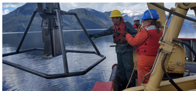
Deployment of sediment core sampling equipment.

salmon populations in order to set catch limits. This project will determine whether a change in primary productivity (carrying capacity) could be responsible for observed long-term declines in some species of salmon.