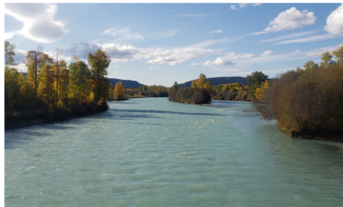
The Chilcotin River.

Landscape level assessments of stressors on aquatic habitats, climate change projections, and population dynamics models can be limited in their ability to accurately describe the cumulative impact that multiple stressors can have on individuals and specific populations because they lack a mechanistic approach that can verify the complex interacting pathways of effects on fish.